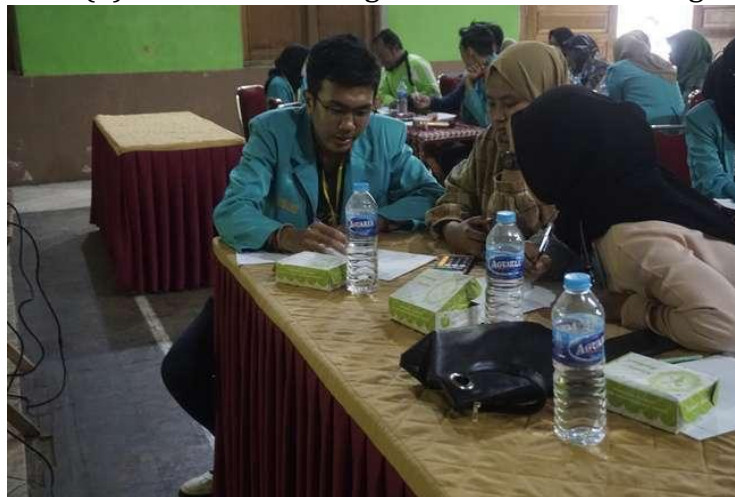
Figure 3. Practices for Preparing Financial Reports

This material is very important material because this analysis is carried out to test the relationship between accounting numbers and the trend of these numbers in a certain time period. Why is it done? (1). Assess the company's financial condition and business results in the past, present and future predictions. (2) Assess the financial strengths and weaknesses of the business venture. (3) Determine strategies for business funding.