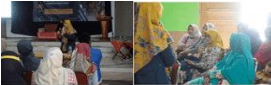
Figure 2. Providing Business Financial Report Material

The first material is about Business Management Analysis. Explanation of general managerial material, analysis of the potential, functions and benefits of MSMEs as well as analysis of production costs, Cost of Goods Production (HPP), and profit and loss reports in financial management of businesses or MSMEs which are used to determine the appropriate costs to be incurred as the basic selling price MSMEs and MSMEs can actually calculate the profit and loss of their business from product sales to see whether the production costs applied are realistic or not. Business Management itself is an activity that aims to plan, organize, direct and supervise. It can be concluded that managerial science is a decision analysis tool to discuss how an organization can achieve its goals in an efficient manner.