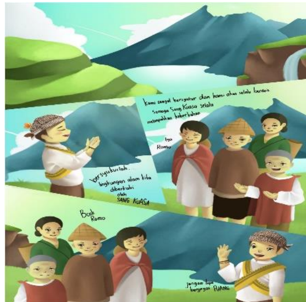
Figure 4. Finalization of the Work Stage