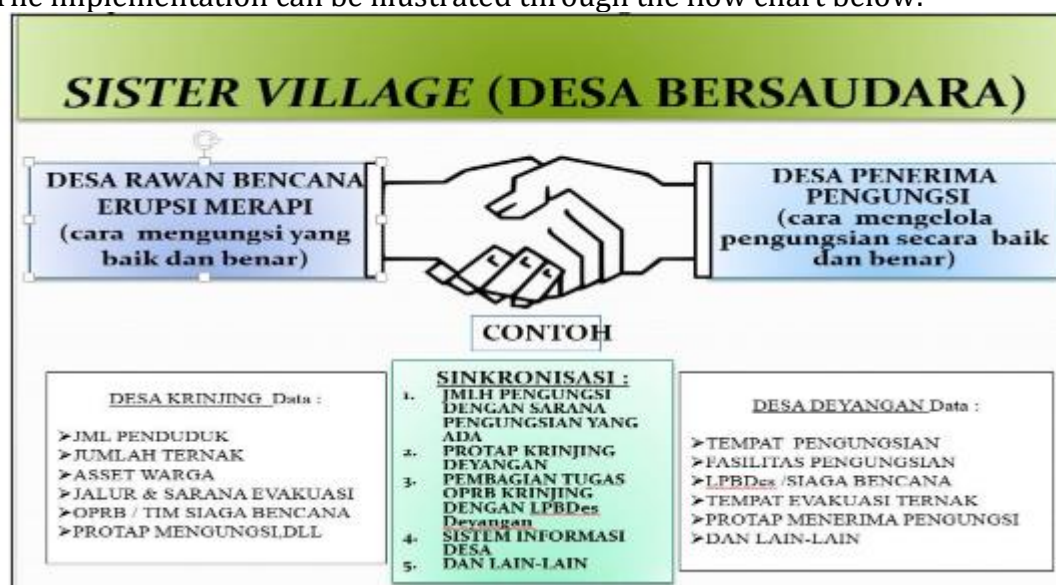
Figure 3. Flow Chart of Sister Village Implementation