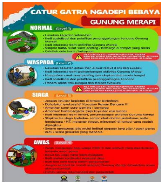
Figure 4. Flow Chart of Sister Village Implementation