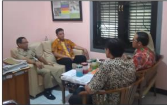
Figure 2. FGD with the chairman of BPPBD Magelang Regency