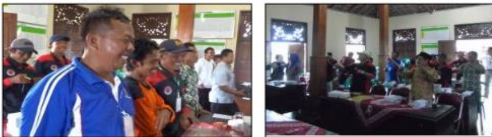
Figure 5. Motivation Training