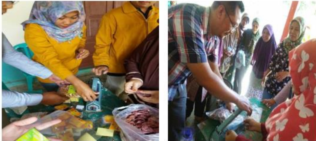
Packaging sealer usage