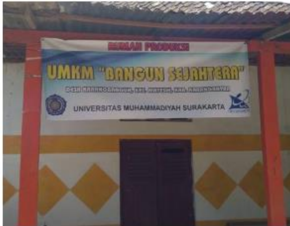
UMKM Bangun Sejahtera

The sustainability of sweet potato processing business in Karangbangun Village, Karanganyar Regency by partners has been pursued through the assistance of the formation of UMKM. There are two UMKM that have been formed, namely UMKM BANGUN SEJAHTERA and UMKM NGUDI REJEKI.