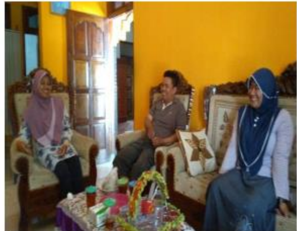
Discussion with village facilitators and Village planning staff