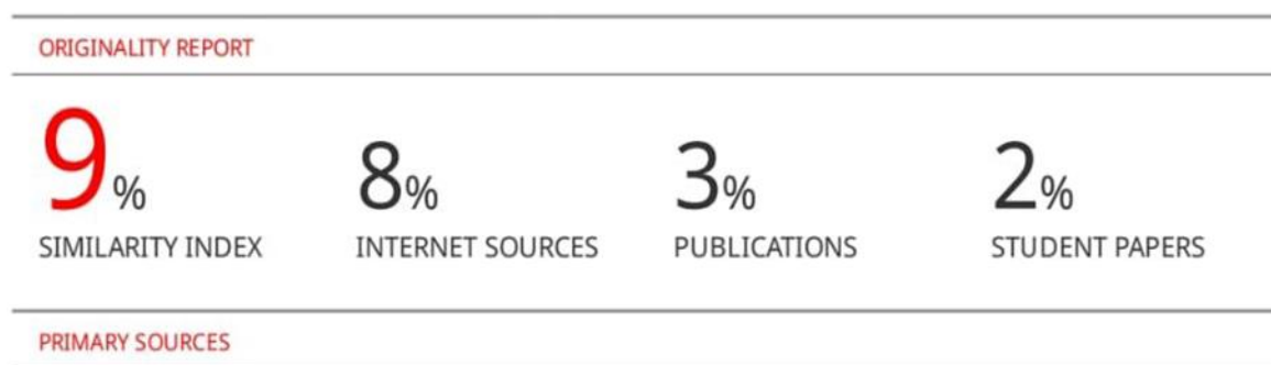
Fig. 3. Results of conventional Turnitin display

if the Turnitin results still do not reach the maximum results determined by the study program or campus [31].