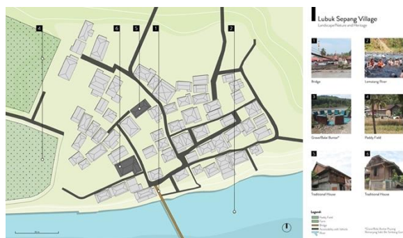
Figure 5. Potentials of Lubuk Sepang Village

Lubuk Sepang Village is located near Lematang River. The location is influenced by the direct access to the water and the best view. It is the water source for daily life, such as washing clothes, dishes, showers, toilets, and drinking water. Using traditional methods, local people also maximise the natural resources from the river, such as sand and stones. The hanging bridge brings a unique view to the village and describes an original meaning of the local value of traditional transportation, especially to the agricultural fields. This structure is also one of the iconic infrastructures in the village. The river becomes vital for people in the village. Therefore, the river and the surrounding area