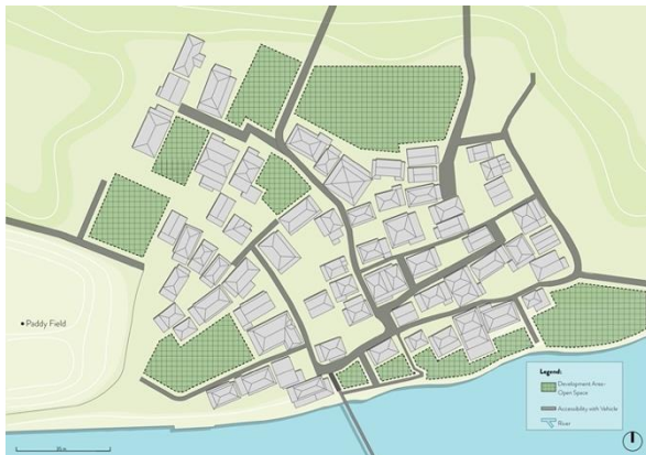
Figure 7. Developing Areas of Lubuk Sepang Village

The Lubuk Sepang Village has three central potentials: nature river, heritage, and agricultural sector. All those sectors also provide a more comprehensive development planning for the village. The Lematang River is an iconic open space for the local people in the river bank area. The hanging bridge also has a special meaning for the village, transporting the locals to the agricultural farms and providing an additional local scenic point. The agricultural farms support the local potential as a tourist attraction. Moreover, traditional houses also strengthen the local potential of its rich heritage.