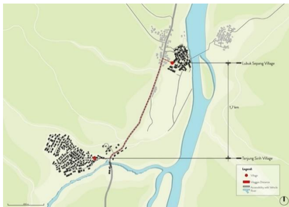
Figure 2. Location of Tanjung Sirih and Lubuk Sepang Villages

This research proposes an integrated Tanjung Sirih and Lubuk Sepang villages model as part of a tourism development program. Therefore, there is an urgent need for an effective and sustainable model based on the specific character of the villages and supported by other sectors as well. Each sector involves and empowers the local community as the main actors of the local development framework. The activation