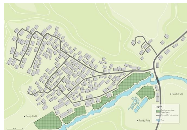
Figure 6. Developing Areas of Tanjung Sirih Village

The Tanjung Sirih Village has an exciting location on the side of the paddy fields, with the main road and bridge as the village's entrance point. The village entrance is signed by the specific activities of local people, with a temporary kiosk with traditional equipment to grill Lemang's traditional food. The spot, method and tools add the specific value of the Tanjung Sirih Village.