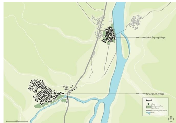
Figure 8. Integration of Tanjung Sirih and Lubuk Sepang Villages

Tanjung Sirih Village and Lubuk Sepang Village are neighbouring villages in the same district of Pulau Pinang. The geographical location influences social characteristics in those villages. The same characteristics start from the exact location near the Lematang River, with agriculture or farming as the main activity for living, language, and culture, and houses like a typical house in Lahat Regency. However, the Tanjung Sirih and the Lubuk Sepang Village have more significant potential combinations than other villages in the same district. As mentioned, Tanjung Sirih Village has a foodscape potential, and Lubuk Sepang Village has a landscape potential. Therefore, the government of Lahat Regency plans to promote these villages as tourism villages in the district.