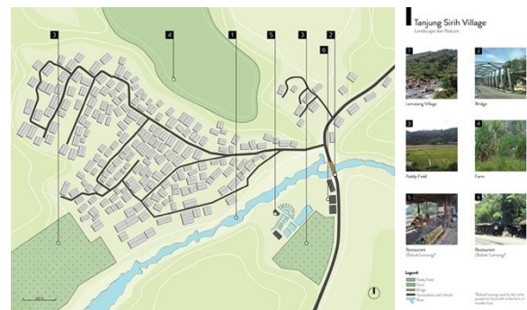
Figure 4. Potentials of Tanjung Sirih Village

Lematang River is located opposite Tanjung Sirih Village. Thus, the village entrance is signed by the river and bridge to the main road. The view of the river and paddy field along the main road frames the village. It is one of the standard geographical views of the villages in Lahat Regency. River and agricultural land frame the regency with its natural beauty.