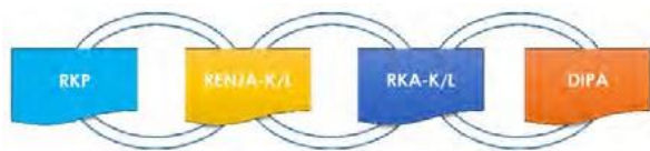
Figure 1. Relationship between Planning and Budgeting Documents