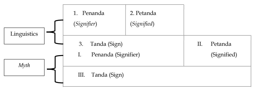
Table 1. Roland Barthes Mythological Process

According to Barthes, semiotics develops into two levels of meaning: denotation and connotation. Take a look at the following chart: