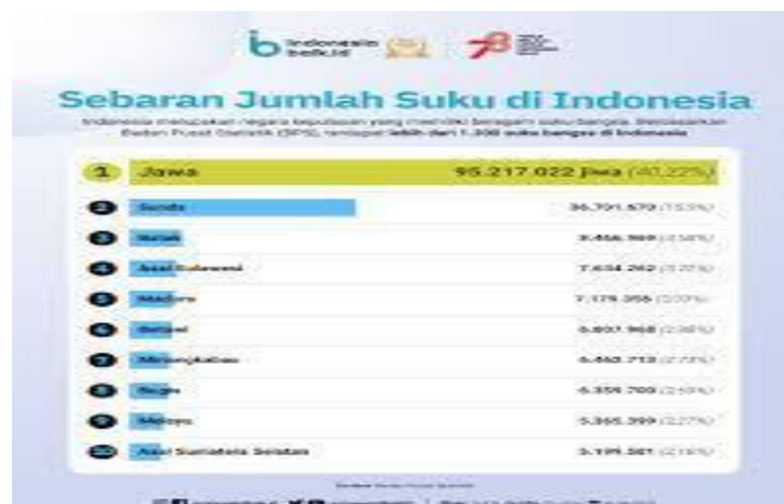
Figure 1. Distribution of the Number of Ethnic Groups in Indonesia.

Diversity is an inevitable reality in social life. It comes in various forms, such as religion, culture, ethnicity, profession, and perspective. As an inevitable reality, diversity should be an asset that enriches social life. Each element of diversity brings different values, traditions, and expertise, which when united can create harmony and mutual progress. However, diversity also holds potential challenges. Differences in values, views, and interests can cause tension or even conflict if not managed wisely. In this context, an attitude of mutual respect, tolerance, and openness are important keys in managing diversity so that it does not become a source of division. On the contrary, if diversity is managed well, it can be a great strength for society. Collaboration between different groups, based on respect for differences, can produce innovation, creative solutions, and social stability. Effective diversity management requires fair policies, inclusive education, and efforts to eliminate stereotypes and prejudice. For example, societies that encourage dialogue between groups and build cross-cultural cooperation are often more advanced in the social, economic, and political fields. By turning differences into strengths, diversity is no longer a threat but becomes the foundation for building a harmonious and productive future [11].