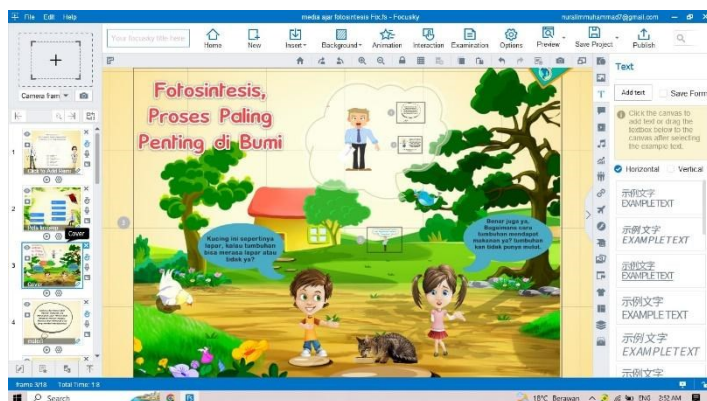
Figure 1. Display of Focusky-based learning media

After compiling the necessary materials for the Focusky-based learning media, the researcher proceeded to develop the media itself. The initial design of the media is illustrated in Figures 1, 2, and 3 below.