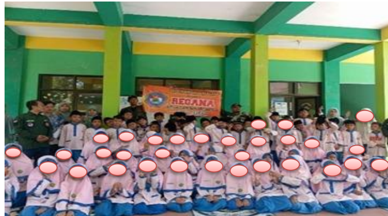
Figure 3. Co-curricular activities, specifically regarding the formation of religious character.

Quran camps, overnight stays ( Mabit ), disaster response training, community service, and educational excursions.