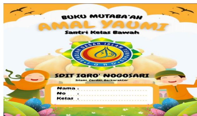
Figure 6. Mutabaah amal yaumi book

Worship ( Ibadah ) mentoring, which entails monitoring religious activities through the Amal Yaumi (Daily Deeds) book, is a strategy designed to heighten students' awareness and habituation regarding worship and good deeds. This programme engages students, teachers, and parents as partners in shaping the children's religious character. The Amal Yaumi book functions as a daily recording instrument, enabling students to reflect on and monitor the observance of obligatory worship (such as the five daily prayers) and Sunnah practices (including Quranic recitation, fasting, acts of charity, and kindness to others). Monitoring occurs daily via a logbook distributed to each student, which parents are required to complete. The programme undergoes consistent weekly evaluation, alongside a comprehensive monthly review where rewards are presented to students who actively maintain religious practices at home. The Amal Yaumi monitoring book is depicted in Figures 6 and Figure 7.