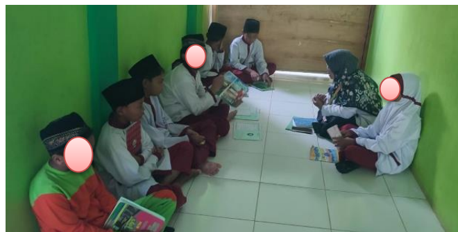
Figure 5. Activities of the al-bayan tahsin and tahfidz group

Worship ( Ibadah ) mentoring, which entails monitoring religious activities through the Amal Yaumi (Daily Deeds) book, is a strategy designed to heighten students' awareness and habituation regarding worship and good deeds. This programme engages students, teachers, and parents as partners in shaping the children's religious character. The Amal Yaumi book functions as a daily recording instrument, enabling students to reflect on and monitor the observance of obligatory worship (such as the five daily prayers) and Sunnah practices (including Quranic recitation, fasting, acts of charity, and kindness to others). Monitoring occurs daily via a logbook distributed to each student, which parents are required to complete. The programme undergoes consistent weekly evaluation, alongside a comprehensive monthly review where rewards are presented to students who actively maintain religious practices at home. The Amal Yaumi monitoring book is depicted in Figures 6 and Figure 7.