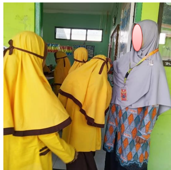
Figure 9. The institutionalised practice of students offering a greeting before entering their classroom.

As illustrated in Figure 8, the structured teaching programme for the primary level ( Tingkat Dini Seri 4B ) maps weekly topics to Core Competency Standards (SKL). Themes such as Iman kepada Malaikat (Faith in Angels) and Adab Berhias (Etiquette of Grooming) are designed to build measurable competencies ( Kompetensi Dasar ) that contribute to seven overarching learning outcomes. This