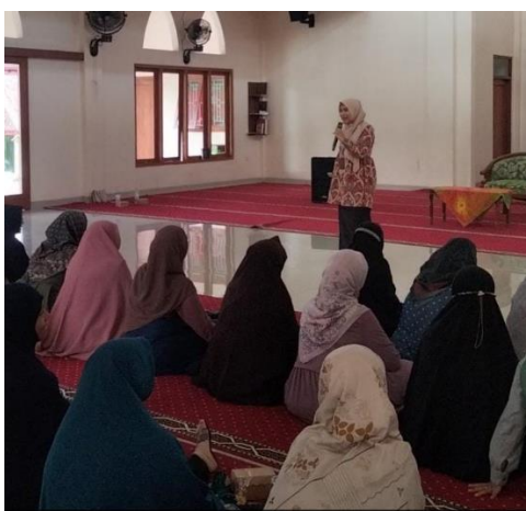
Figure 10. Parent-teacher meeting

A similar consensus was reached during the Focus Group Discussion (FGD): "Parents play a crucial role in shaping their children's religious character through monitoring worship activities ( Amal Yaumi or daily deeds). This involves providing motivation, acting as role models, creating a conducive environment, monitoring the development of children's worship through the Amal Yaumi book, and maintaining communication with the school. This creates synergy in instilling religious values and forming good habits in children." (Group Discussion, 13 September 2025). Based on the research findings, statements from the principal, and the FGD results, it can be concluded that religious character formation at IQRO' Nogosari Integrated Islamic Primary School is the result of synergy between three main pillars: teachers, parents, and the school. Teachers act as role models and facilitators through instruction and habituation; parents reinforce these values at home by monitoring worship and creating a conducive environment; and the school provides the culture, policies, and special programmes that support the development of students' religious character. Synergistic collaboration between these three pillars is key to achieving optimal religious character development at the school.