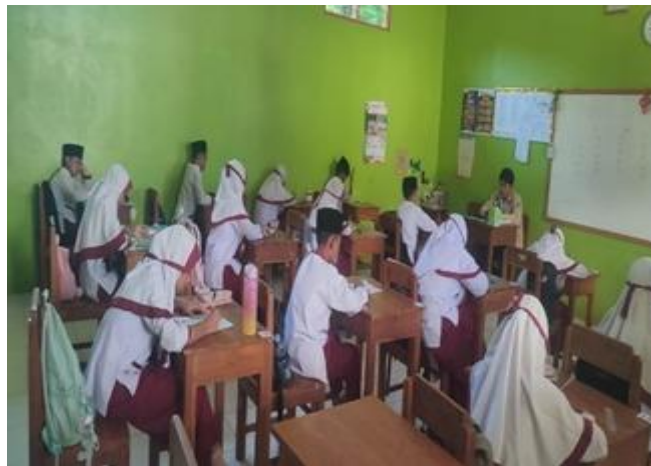
Figure 2. In-class learning activities, or intracurricular activities

Furthermore, the implementation of the ADLX Introfex curriculum at IQRO' Nogosari represents a holistic endeavour. The Intracurricular domain serves as the nucleus for value integration; the Co-curricular domain acts as an essential extension for deepening comprehension; and the Extracurricular domain offers a practical arena for application and holistic growth. Collectively, these three interconnected programmes create a cohesive educational ecosystem wherein cognitive development and religious character formation occur simultaneously and synergistically. Their combined effect makes a significant, integrated contribution to the comprehensive development of the pupils' religious character, thereby fulfilling the curriculum's vision of a balanced spiritual and academic education.