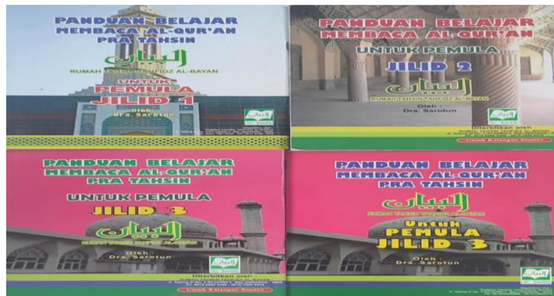
Figure 4. Al-bayan book