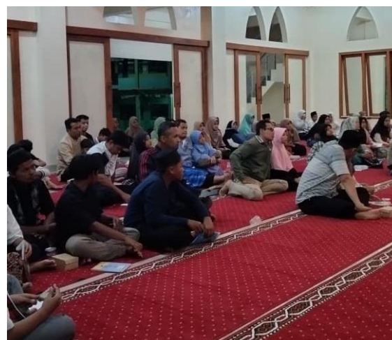
Figure 11. Monthly Islamic study session

As depicted in Figure 10, the Parent-Teacher Meeting serves as a strategic forum for fostering synergy between the school and the family in the cultivation of the pupils' religious character. Through