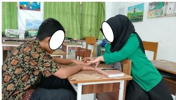
Figure 1. Autistic student activity, with special assistance from the teacher