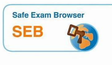
Figure 1. Safe Exam Browser application

SEB is software that can help maintain security and order in the implementation of online exams or tests . SEB, the software used to maintain security and order in the implementation of online exams, can be installed on the computer or laptop that will be used to take the exam. The software sets up several rules that examinees must abide by, such as the prohibition of opening other applications or using a camera. At ABBS High School, all students use laptops to take the midterm and final exams.