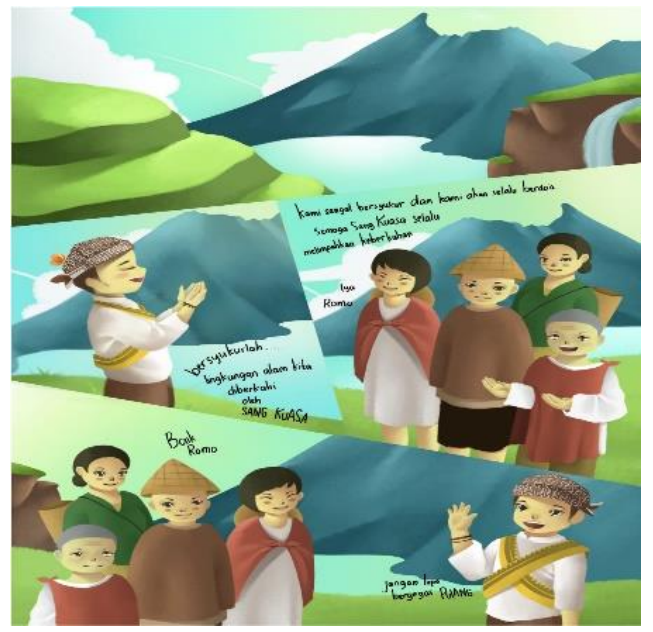
Figure 4. Finalization of the Work Stage

F. Illustration, the researcher created semi-realistic illustration characters with a more interesting concept and not monotonous with visual characters like cartoons and final sketch can be shown in figure 4: