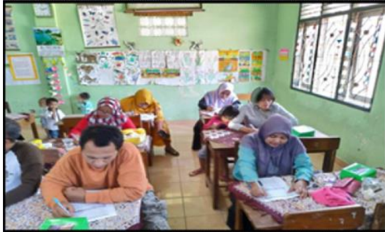
Figure 2. The Participants work on the pre-test before counseling

The range of values in the pre-test and post-test are grouped into 3 categories: 1. The partners do not understand the value <60, 2. The partner understands the test value of 70-80, and 3. The partner understands the value > 80. before counseling shows that there are still more than 50% of the 20 partners who do not understand the drug, its function, the dangers of the drug if it is used incorrectly and the dangers of drug abuse (with a value <60). Partners who score 70-80 are 15% and partners who score > 80 are 30%.