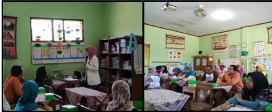
Figure 4. The Participants' discussion activities in counseling at SDN Bumirejo 1

The Following pictures are the discussion and the enthusiasm of the participants in participating in the extension activities using the CBIA method.