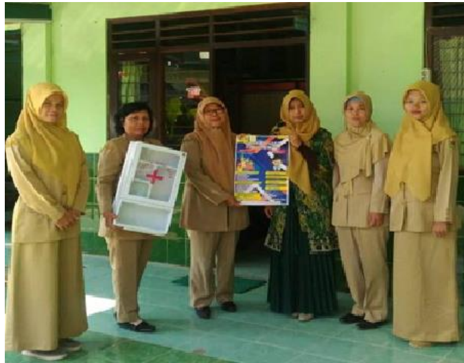
Figure 8. Provision of first aid boxes and posters to SDN Bumirejo I

The implementation team gave books in the form of comics of young pharmacists to give deeper provisions to select pharmacists in their role as young pharmacists. In addition to provide comics, the implementation team also provided education indirectly to the students, teachers and guardians in the form of posters and videos to make it is easier for the students to understand drugs and drug education content for students. The implementation team in addition to providing information in the way above, providing posters, videos also encouraged SDN Bumirejo to revive UKS given the importance of the role of UKS in the management of illness and drug management in schools. The following are posters and first aid kits in order to bring the UKS function to SDN Bumirejo I in the first place: