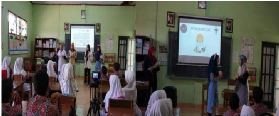
Figure 6. The atmosphere of Operetta at SDN Bumirejo I

The following is the atmosphere of Operetta implementation at SDN Bumirejo I: