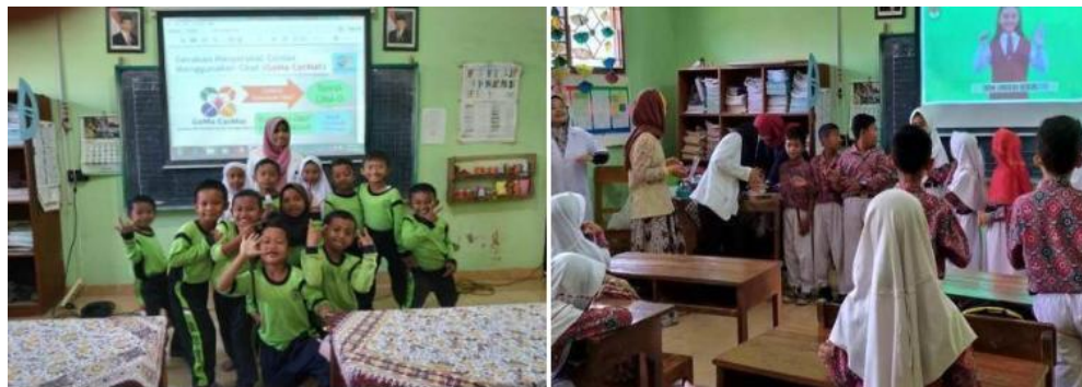
Figure 7. Selection of young pharmacists at SDN Bumirejo I

The target of Operetta implementation is the selection of young pharmacists who will provide knowledge to their peers regarding their use of drugs, the dangers of drugs if not used appropriately and the danger of drug abuse. Reminding the students of their age when taking medicine must be accompanied by the parents should not be haphazard in receiving drugs or food and drink from unknown people. Reminding that the medicines are not candy. The Young pharmacists are chosen based on the criteria of activeness during the Operetta and question and answer as well as based on the value of doing smart quiz. The following atmosphere of the selection of young pharmacists at SDN Bumirejo I: