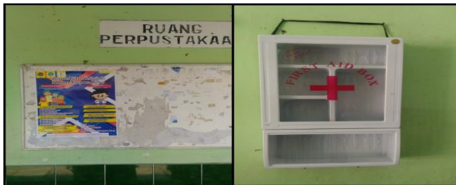
Figure 5. media used in helping provide educational exposure

The Following pictures are the discussion and the enthusiasm of the participants in participating in the extension activities using the CBIA method.