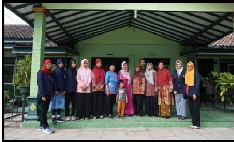
Figure1. Coordination team with the school and parents of the students