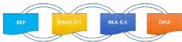
Figure 1. Relationship between Planning and Budgeting Documents