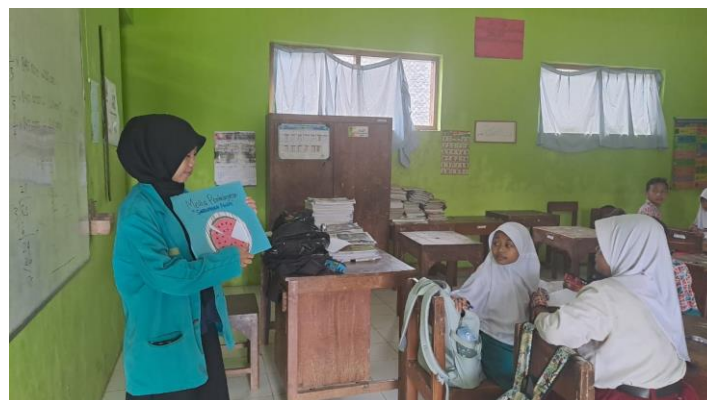
Figure 2. In-Class Activities

The second phase of classroom instruction entailed the articulation of learning objectives, participation in group discussions to address problems, assignment presentation, drawing inferences from the learning experience, providing feedback, and monitoring learning progress (show as figure 2). Additionally, during in-class instruction, instructional media, exemplified by watermelon fractions, were utilised to augment understanding of fractional concepts. In the control class, the instructional process mirrored the second phase, with the exception that material explanations were delivered during class time, resulting in diminished student engagement in the learning process.