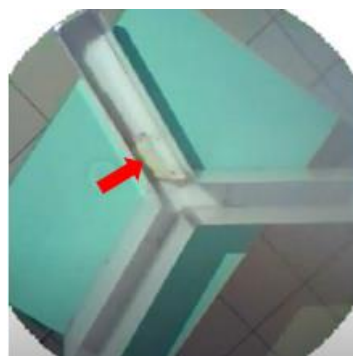
Figure 1. Y-maze. Red arrow: the rat in the Y-maze

Y-maze test was performed after treatment (day 18) to assess the working