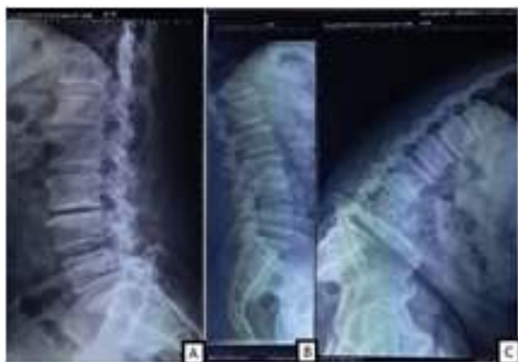
Figure 3. The conventional lateral radiograph of one of the study subjects (A) shows osteophytes and there is no spondylolisthesis. The extension lateral radiograph (B) demonstrates no spondylolisthesis, but the flexion lateral radiograph (C) reveals anterolisthesis at the level of L4-5.

Other findings of degenerative disease of the spine such as osteophytes and spinal joint narrowing on both conventional lateral and dynamic lateral (flexion and extension) lumbosacral radiographs were similar, in which osteophytes were found in all subjects (100%), and spinal joint narrowing were seen in 83.3% of subjects. However, another finding in the form of vacuum disc phenomenon was different. We found that vacuum disc phenomenon was more common on extension lateral radiographs (35.7%) than on conventional lateral radiograph (28.6%) and flexion lateral radiographs (11.9%).