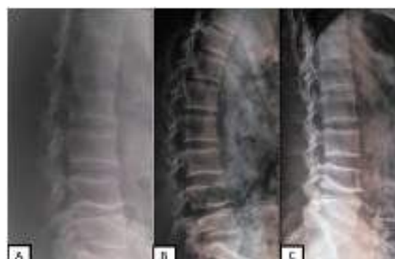
Figure 2. The conventional lateral radiograph of one of our samples (A) shows osteophytes in the vertebral body and there is no spondylolisthesis. On the flexion (B) and extension (C) lateral radiographs, there is posterolisthesis at the level of L4-5.

In this study, we found that spondylolisthesis was mostly detected on flexion dynamic lateral radiographs with the average of 13.64% listhesis. Then followed by extension dynamic lateral radiographs in 29 patients and conventional lateral radiographs in 22 patients, with mean listhesis of 8.78% and 6.99%, respectively. The statistical analysis of our findings demonstrated a significant difference, in which spondylolisthesis indicating the presence of degenerative instability can be detected more through dynamic lateral radiographs (flexion and extension) than conventional lateral radiographs. Thus, dynamic lateral radiographs can affect decision in determining of treatment options for patients with degenerative spinal joints (Figure 2 and Figure 3).